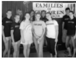
Preble High School – STING Cancer — 2008 Large Group Award Recipient

A Pair and A Spare Altrusa Club of Green Bay American Red Cross Routine Transportation Drivers Ameriprise Financial Home & Auto Insurance - Greater Green Bay Habitat for Humanity Team Brown County Homeless and Housing Coalition CASA (Court Appointed Special Advocates) of Brown County, Inc. Chappell Elementary School PTO Circle K International, UW-Green Bay Goodwill Place Volunteers Green Bay Botanical Garden Horticulture Volunteers Green Bay West Rotary Club Reading Buddies Program at Lincoln School Imaginasium Volunteers at the Boys and Girls Club of Green Bay Lombardi Middle School PCA (Parent Communication Association) Management Team of The Gathering Place National Alliance on Mental Illness of Brown County